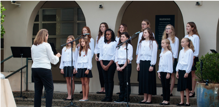
Middle School Chorus, Veterans' Day Assembly